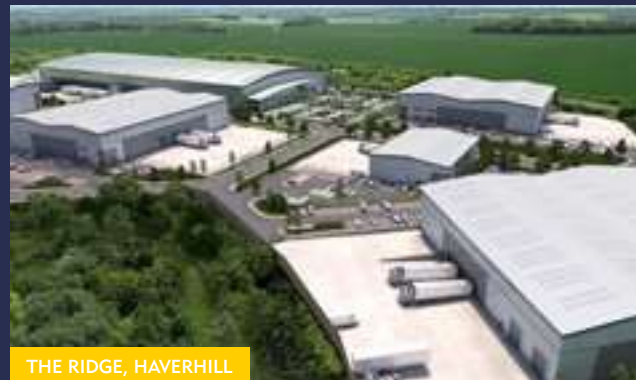
THE RIDGE, HAVERHILL