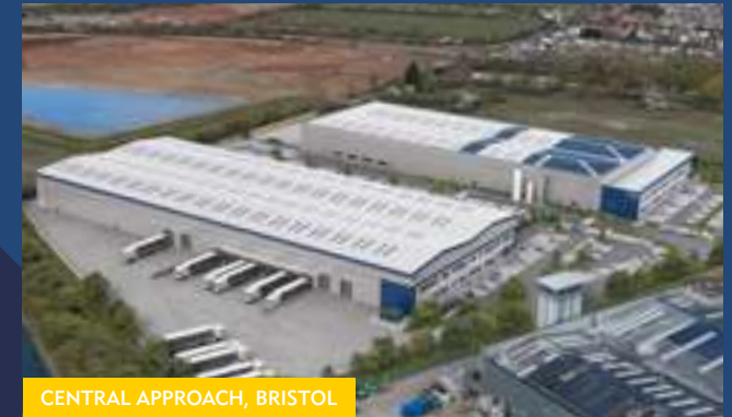
CENTRAL APPROACH, BRISTOL