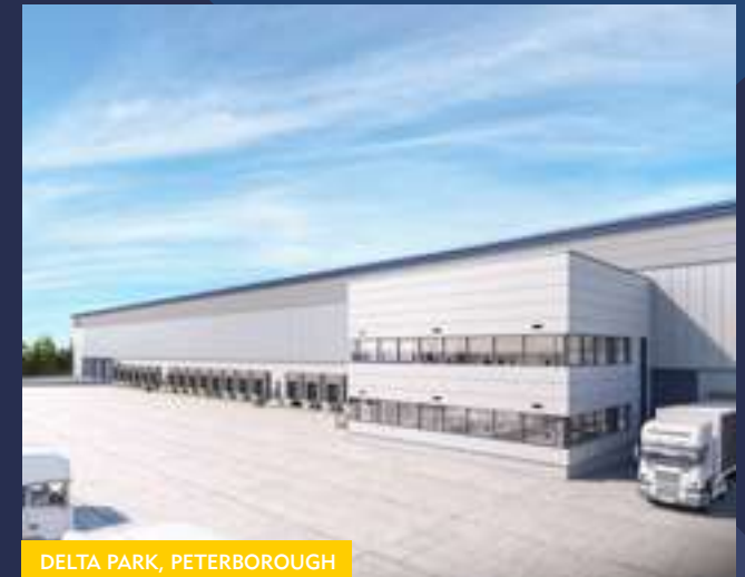
DELTA PARK, PETERBOROUGH