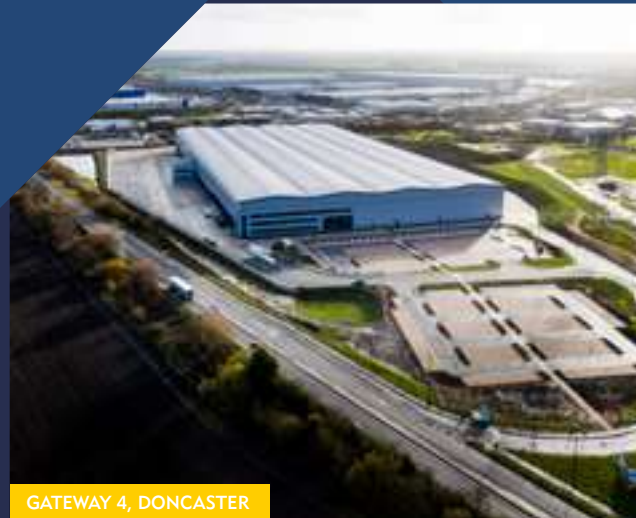
GATEWAY 4, DONCASTER

Most importantly, we have skin in the game. We're a private, owner-managed organisation with no PLC or string of shareholders to report to. Decisions are made quickly and we apply a more hands-on approach in order to make your business, our business.