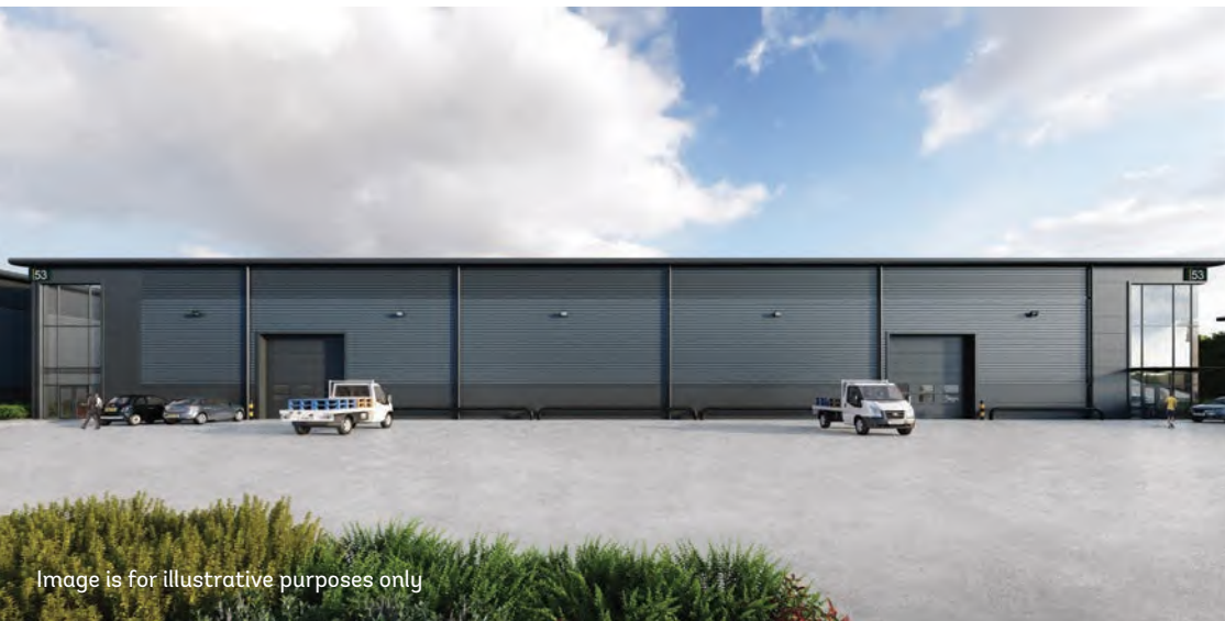
Image is for illustrative purposes only